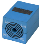
CM PPS module with Multidiameter™