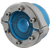
C RS SLO seal

For detailed information, please visit roxtec.com .