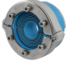
C RS SLO 75 ALU