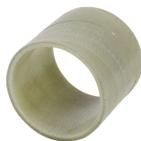
SL GRP sleeve