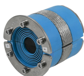
RS BG™ 密封系统