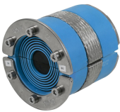
RS BG™ seal