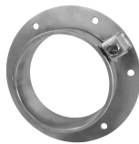
SLF RS BG™ sleeve