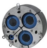
H3+1 UG™ 密封系统