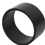
SL RS 套筒