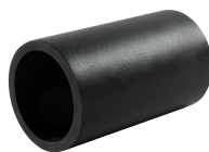
SL PPS sleeve